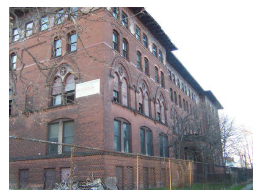
St. Vincent's Convent, waiting to be rediscovered.

Ellicott Street should be seen as a two-way boulevard, but from Goodell Street north it is configured for only one-way traffic, confusing the flow of traffic, impeding full exposure to the neighborhood's scenic and architectural assets, and