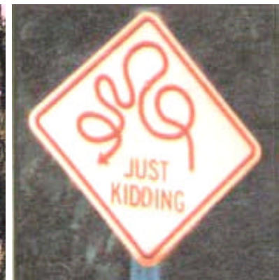
Creative, eccentric signs have been successful at attracting tourists and onlookers. Isn't this a noble goal for Midtown?