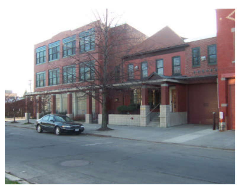
The German American Brewing Company malt houses, on Ellicott at the terminus of Edna, are now offices for Osmose.

Most conspicuous is a small grouping of low-rise commercial structures recently renovated by Osmose, near the intersection with Edna Place. Built a century ago as a malting house for the German American Brewing Company, this complex at 980 Ellicott is a case study in enlightened adaptive reuse. Osmose has been meticulous in attention to the streetscape, with closely-knit trees planted within tastefully selected iron grilles. A block up, the Mount Cavalry CME Church acts as a placeholder for the corner with Dodge, forming a striking architectural pose. The home at 2050 Ellicott, part of the collection of houses on Coe Place, is perhaps the most beautiful cottage-style residence in Midtown. These historic structures are paired with many newer developments that in one way clash with the older built environment, but in other ways does add something to a vital mix of architectural styles, shapes and materials. Perhaps the oddest of these juxtapositions is the gated community at 1030 Ellicott, where thirteen rowhouses face toward a central courtyard and common swimming pool. The less successful of these intrusions are the two suburban-style duplexes at 1037 and 1047 Ellicott, completed in 1991. The duplex at 1047 Ellicott is perhaps the most damaging, as it forms a highly disconcerting terminating vista for Coe Place.