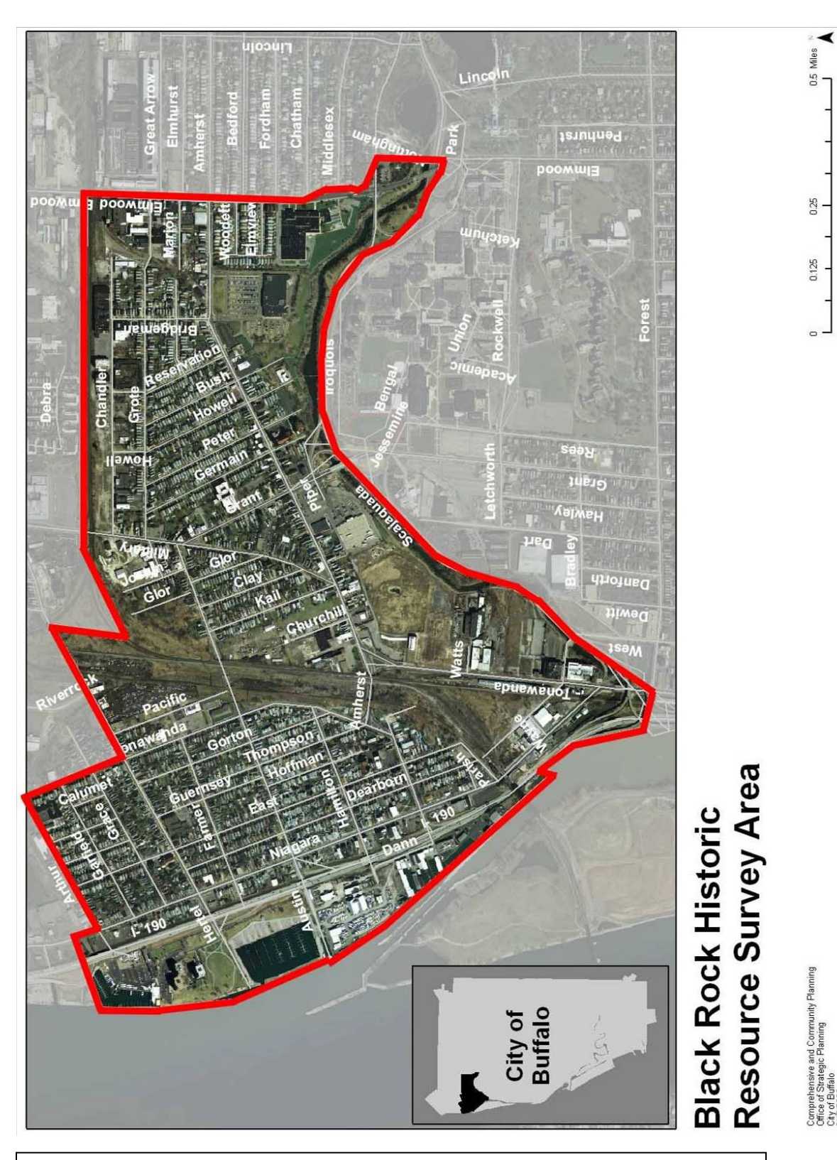
Fig 1.1 Black Rock Historic Resource Survey Area Inset map shows location of Black Rock Planning Neighborhood within the City of Buffalo